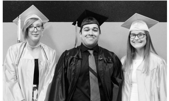
Class of 2019 Senior National Honor Society Members