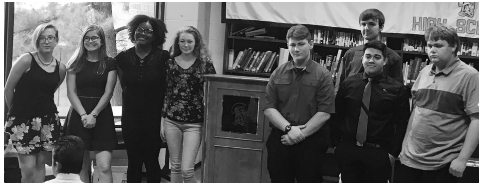
2019 Titan Academic Top Ten